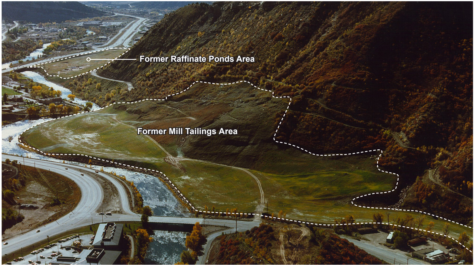
View of Durango, CO, Remediated Processing Site (1991)