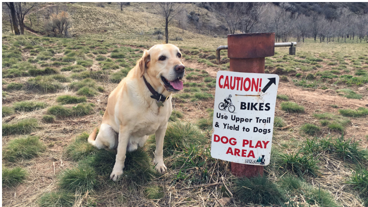
After the Department of Energy (DOE) completed surface cleanup, the city of Durango transitioned the former Durango, Colorado, uranium processing site into a public park and recreation area. As a dog-friendly park, the LM site manager's dog, Drake, is able to join site inspections.

publicly accessible at: https://www.energy.gov/lm/services/applied-studies-and-technology-ast/ast-reports