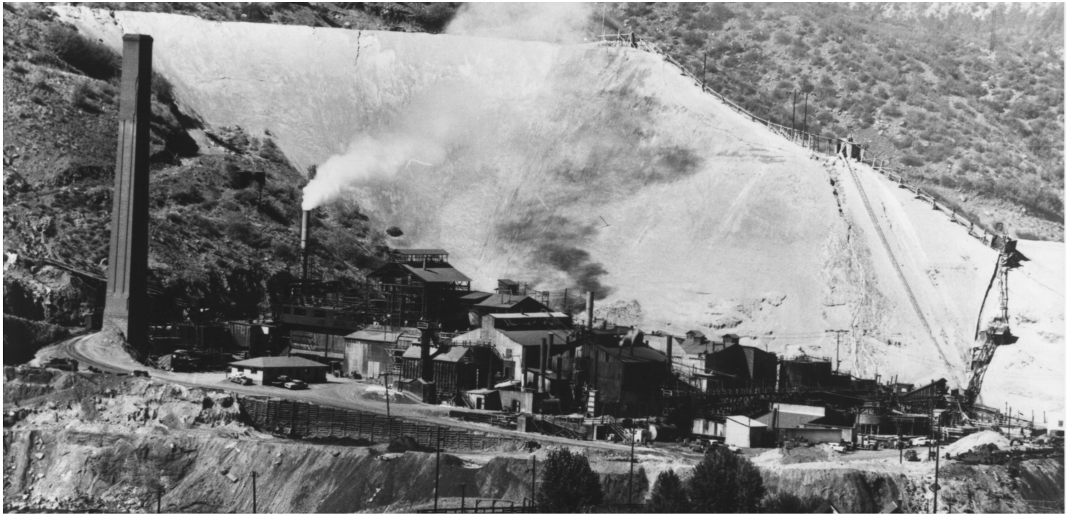
Durango mill during active operations (date unknown). The smokestack for the old lead smelter is to the left, with the large tailings pile and conveyances across the center.